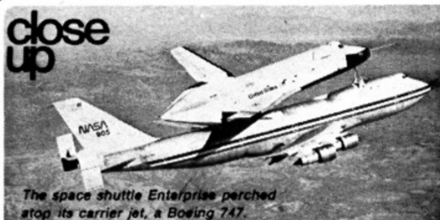
The space shuttle Enterprise perched atop its carrier jet, a Boeing 747.