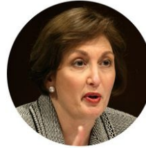
Jamie S. Gorelick Fmr. U.S. deputy atty. gen.