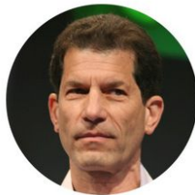
Jon Rubinstein Fmr. HP, Palm, Apple exec