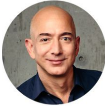
Jeff Bezos Amazon Chairman, CEO